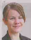
BY LEAH TINDILL tindill@ nnews.com.au

"Families are complex and poor families are particularly complex be-